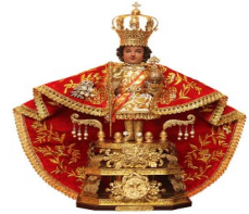
National Shrine of Santo Niño de Cebú

Served by the Augustinian Friars since 1796