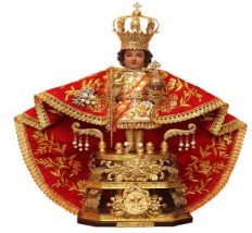
National Shrine of Santo Niño de Cebú

Second Sunday of Advent – December 6, 2020