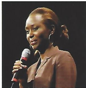
Immaculée Ilibagiza Renown speaker and author of Left to Tell surviving the Rwandan genocide