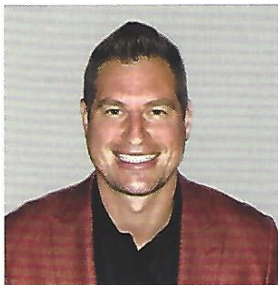
Brent Celek Philadelphia Eagles celebrated tight end and Superbowl LII champion

Man Up Philly 2020 invites the men of the Archdiocese of Philadelphia to the 12 th Annual Men's Spirituality Conference. We encourage all men – fathers, sons, brothers, friends – to join us for an inspiring day of faith and fellowship. Become the man God is calling you to be! Rediscover the power and meaning of your faith!