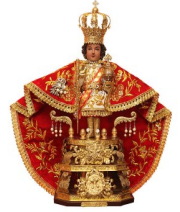
National Shrine of Santo Niño de Cebú

"Creating A Community Of Involvement And Evangelization"