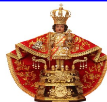
National Shrine of Santo Niño de Cebú

Served by the Augustinian Friars since 1796