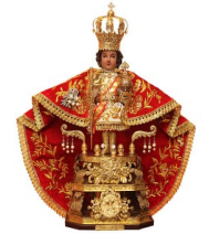
National Shrine of Santo Niño de Cebú

"Creating A Community Of Involvement And Evangelization"