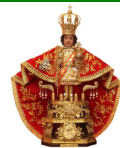
National Shrine of Santo Niño de Cebú

"Creating A Community Of Involvement And Evangelization"