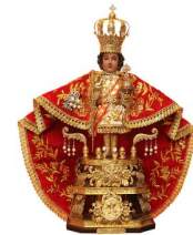
National Shrine of Santo Niño de Cebú

“Creating A Community Of Involvement And Evangelization”