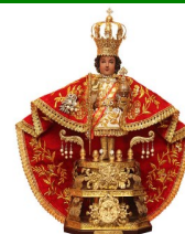
National Shrine of Santo Niño de Cebu

"Creating A Community Of Involvement And Evangelization"