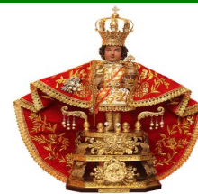
National Shrine of Santo Niño de Cebú

26 th Sunday in Ordinary Time – September 27, 2020