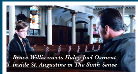
Bruce Willis meets Haley Joel Osment inside St. Augustine in The Sixth Sense