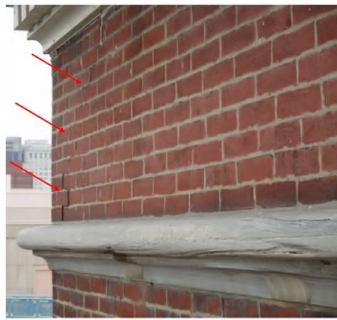
Cracking & repointing of brickwork