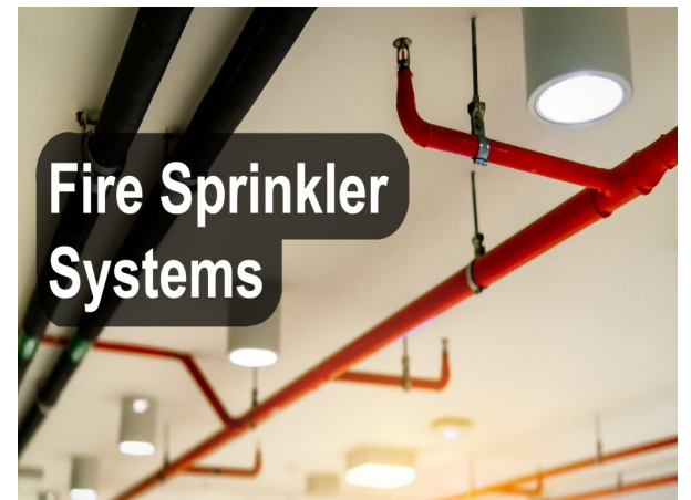
Fire Sprinkler in Community Building