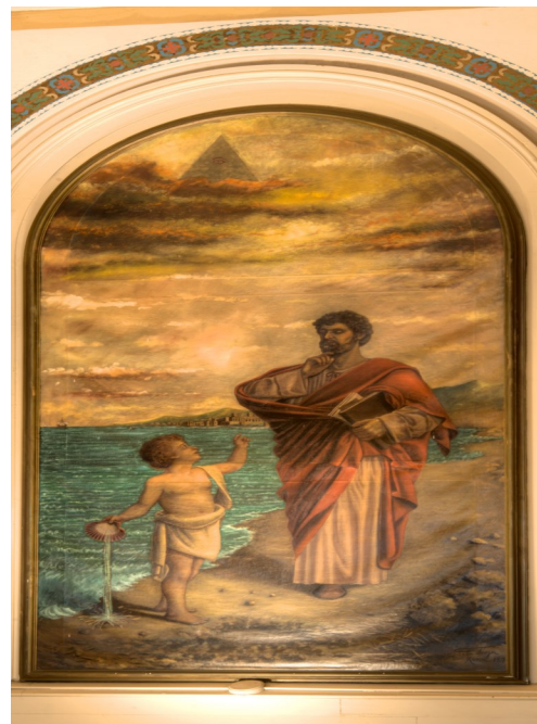
Artwork restoration (Eight St. Augustine Lunettes)